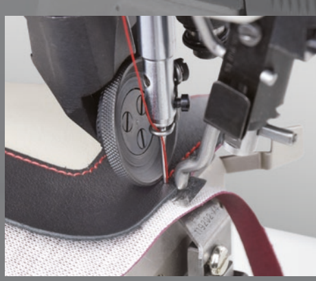
PFAFF 571/ 1571 with edge trimming mechanism