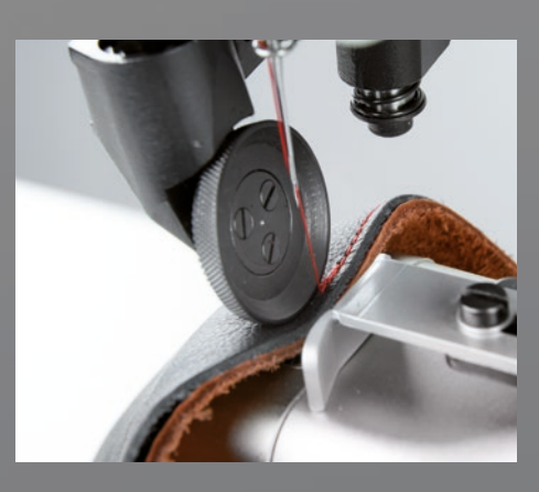
PFAFF 591/ 1591 with edge trimming mechanism