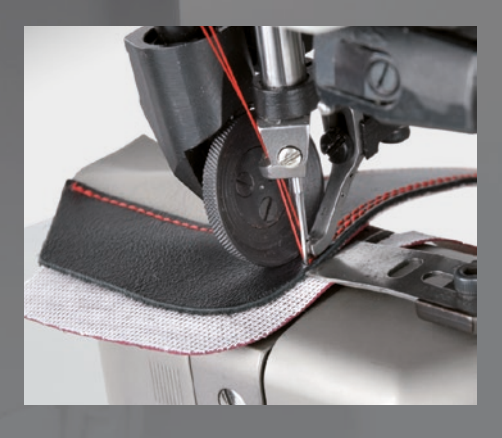
PFAFF 574/ 1574